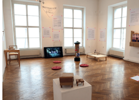
Exhibition view „Historisiert euch!“ Volkskundemuseum Wien 2022

In order to show that queer people have always existed, we have decided to use the word for people from earlier times, even if they would not have called themselves so at that time. Each generation faces its own challenges and many benefit from the work already done by previous activists who resisted the prevailing heteronormative system.