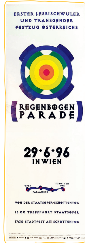
Poster of the 1 st Rainbow Parade Vienna 1996

+ The abbreviation LGBTQIA+ has only evolved over the years, becoming longer and longer, thus reflecting the great diversity in queer communities. The + stands for the future terms that may still join the series of letters. The effect of this is that the project can also be seen as open and never finished , always in motion, renegotiating, co-determining.