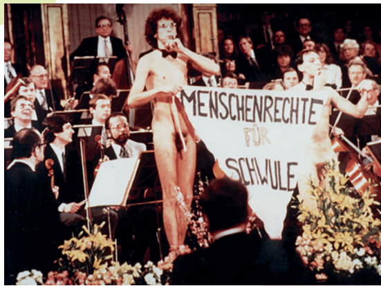
Protest action New Year's Concert 1982

Vienna's first of many actions by queer activists was the Whitsun meeting (Pfingsttreffen) in 1977 – at this gay walk, organized by the group CO , gay men from German-speaking countries walked along the Ring holding hands and ensuring visibility. This was also done in 1980 by the HOSI (Homosexual Initiative) with its participation in the „Wiener Festwochen alternativ“. With the argument of the then ban on advertising and associations for homosexual acts, the city of Vienna tore down the HOSI booth with a digger. This triggered a great wave of solidarity